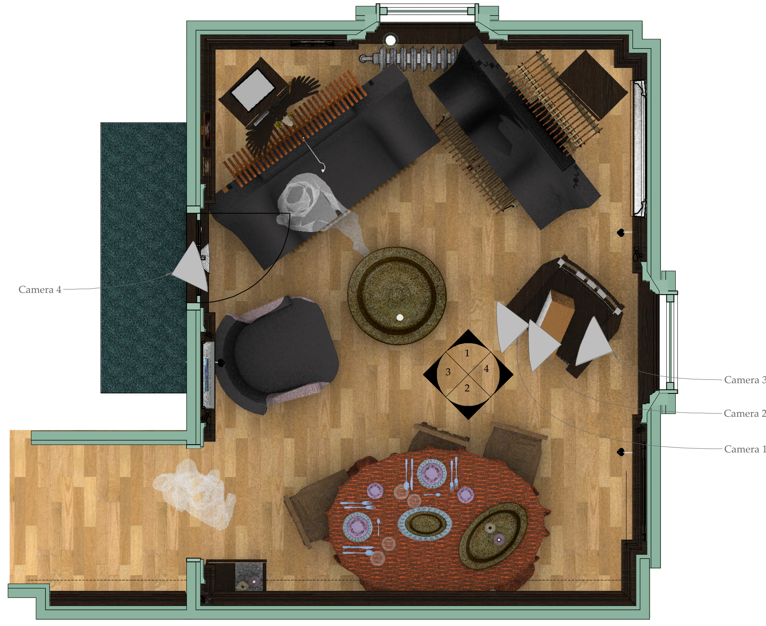
Plan 'Set North' ^ Scale 3/4" = 1'-0"