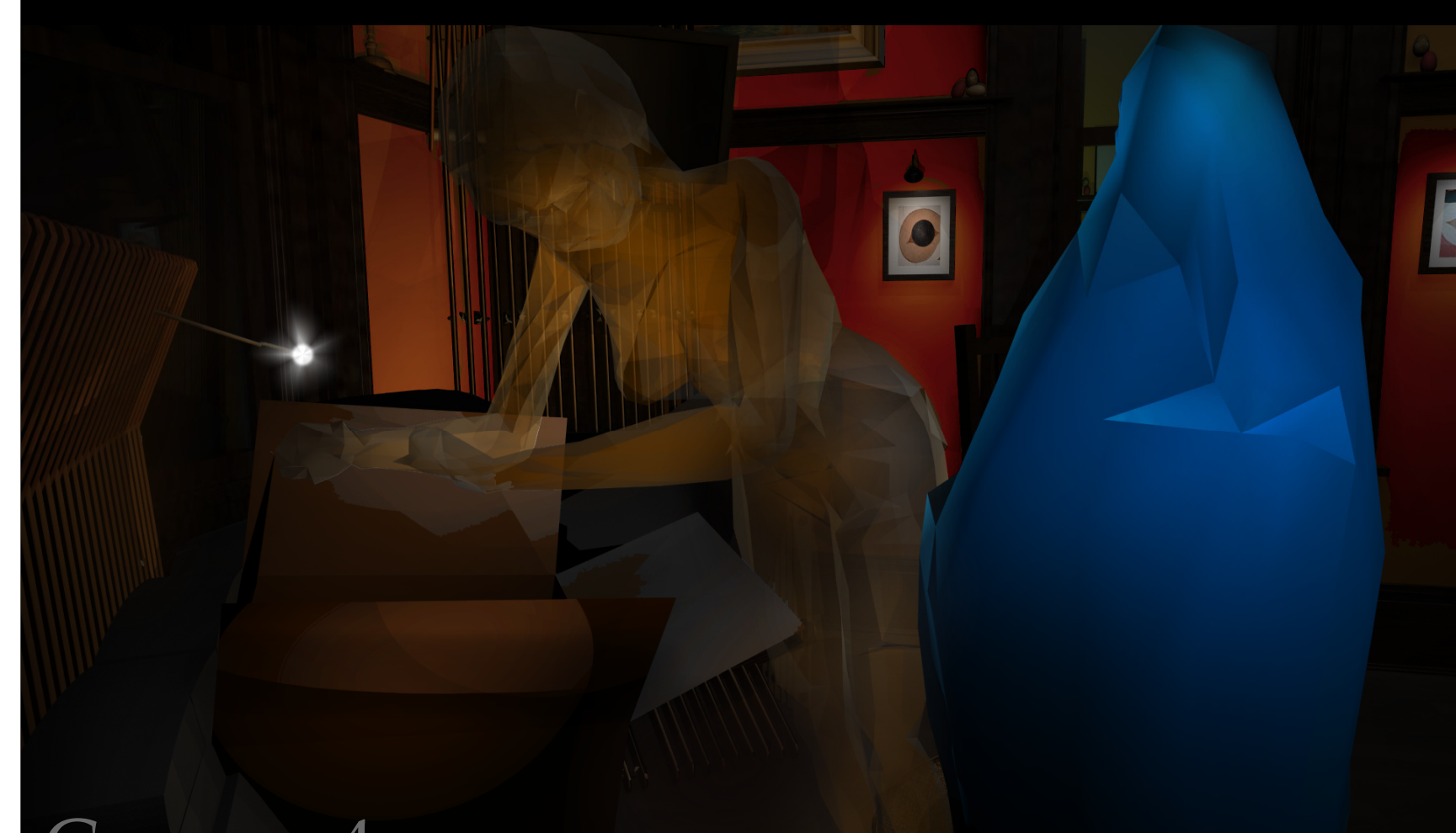
Camera 4 30mm