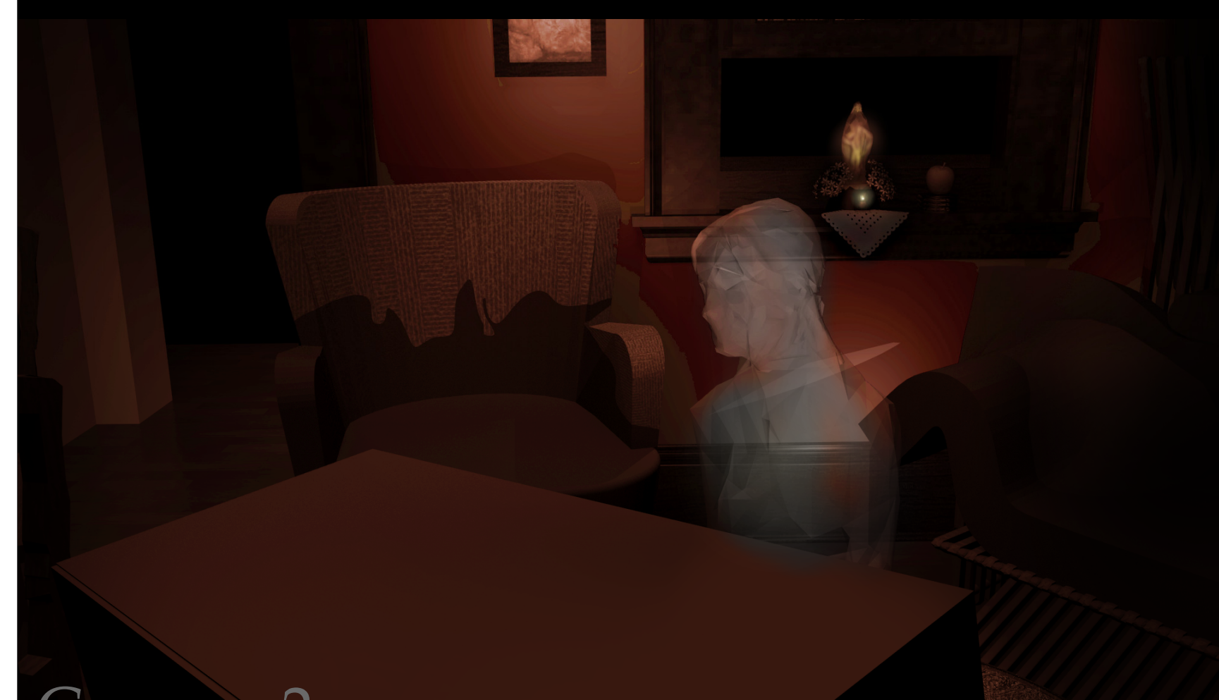
Camera 2 37mm