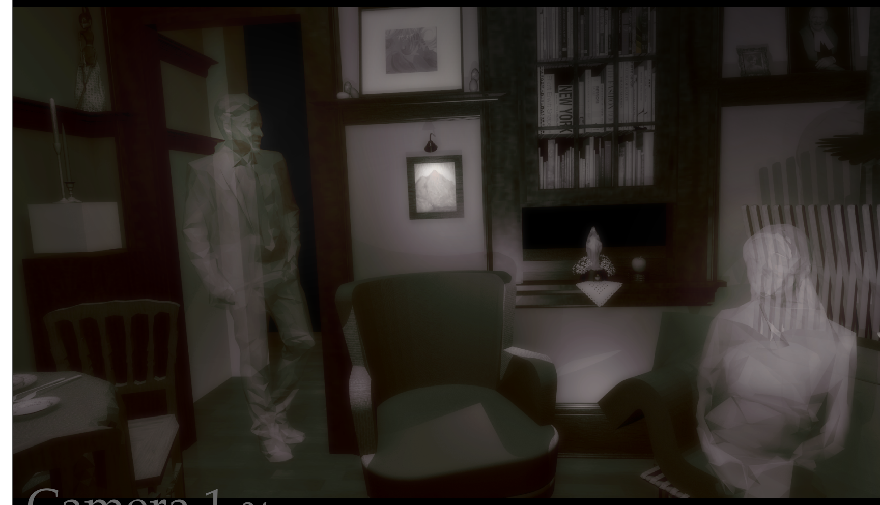
Camera 1 24mm